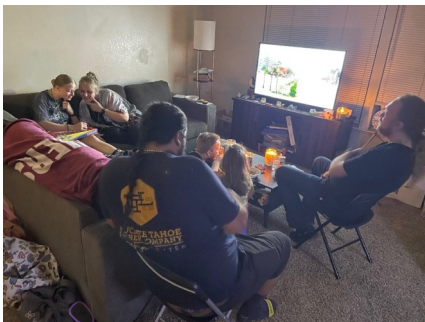
More Hurricane Party.