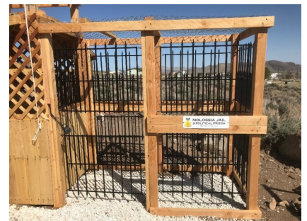
Jail and Political Prison