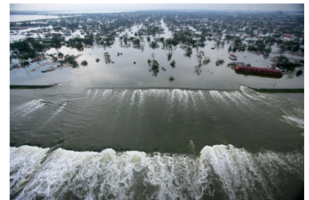
Flooded New Orleans