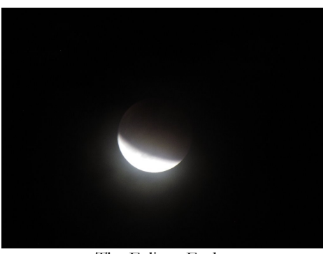
The Eclipse Ends