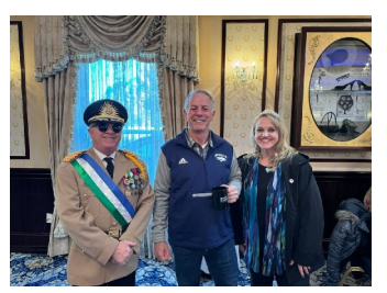
With Nevada Governor Joe Lombardo.