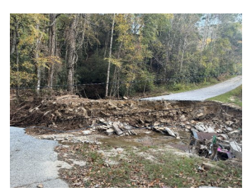
Washed Out Road