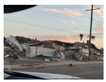
Annihilated Arts District