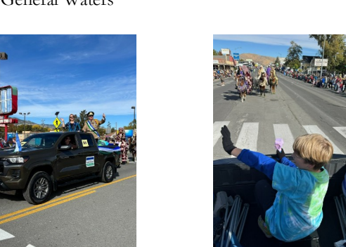
On The Parade Route