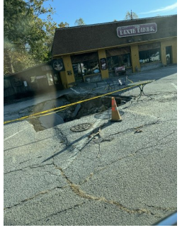
Parking Lot Sinkhole