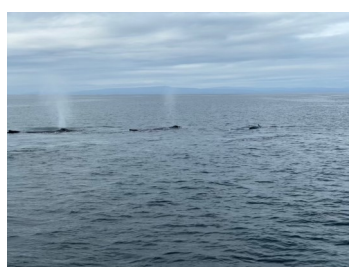
Three Humpback Whales