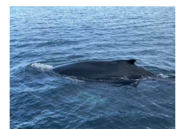
Whale Next to the Boat