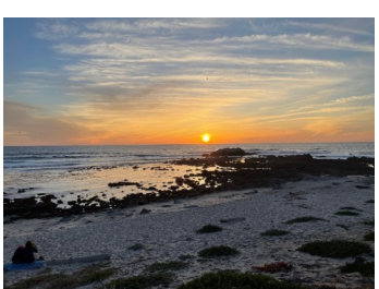
Sunset Over Tidepools