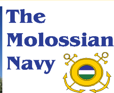
BE A PART!

WWW.MOLOSSIA.ORG/NAVY.INDEX.HTML AND WWW.MOLOSSIA.ORG/MILACADEMY./INDEX.HTML