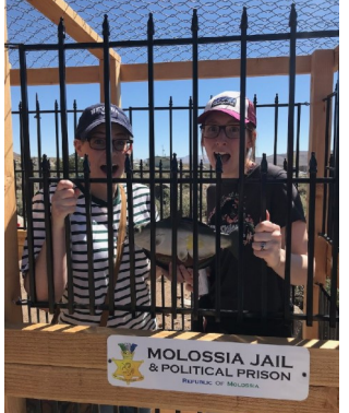
Visiting Tourists In Jail for Importing Catfish