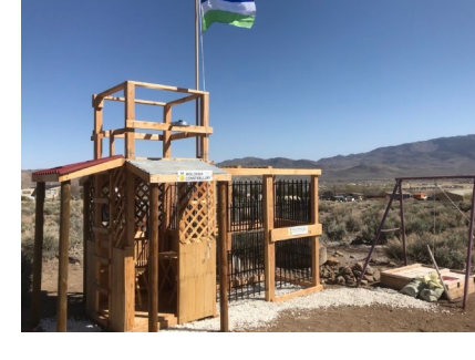
Constabulary And Salt Mine