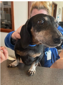
Max the Dachshund