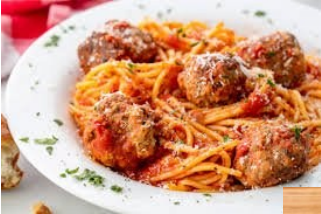
Spaghetti and Meatballs

Molossia's national cuisine is simple and tasty - and rather eclectic. Several dishes have been borrowed from other cultures and adopted into our own. The ingredients and spices for these dishes are generally found in many Molossian homes and restaurants.