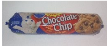
Of Course Cookie Dough!