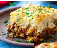
Lasagna and Shepherd's Pie