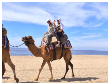
Riding A Dromedary