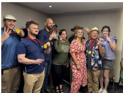
Trivia Team Desert Penguin!

The MicroCon Gala was a semi-formal ball, arranged as a soirée following the convention. Attendees arrived in the hotel conference room-turned-ballroom at 6:00 PM, dressed in their finery for an evening of dining and hobnobbing. After a magnificent dinner, dancing and socializing continued until the evening wound down and each leader and their party took their leave. Thus ended this year's MicroCon Montréal event. After this year, the next MicroCon is planned for San Diego, California, in 2027. Until then, MicroCon 2025 was an amazing event and one of memories and experiences that will last for a very long time!