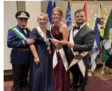
Molossia and Iron-land