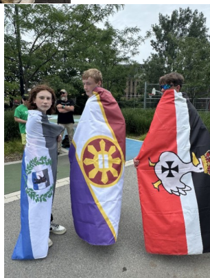
Micronational Flags at the Nemean Games.