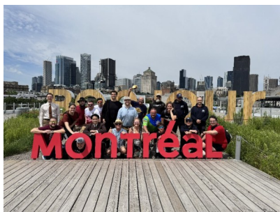
World Leaders In Montréal!