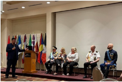
10th Anniversary Roundtable Discussion.