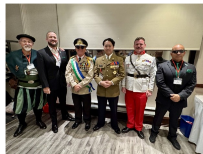
World Leaders At The Diplomatic Reception.