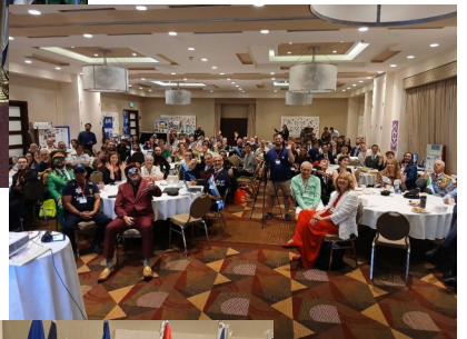
An August Assemblage.