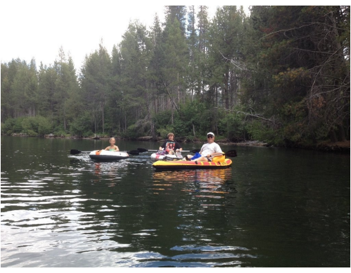
The Navy exploring Donner Lake.