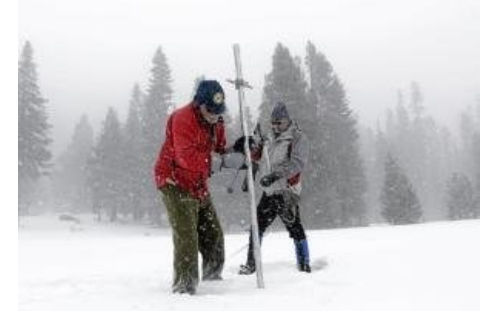
Measuring the snowpack

If storms continue and reservoirs and aquifers are filled with runoff by this summer, it won't necessarily mean a complete end to the drought. It can only help, however, and we will take whatever we can get.