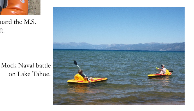
His Excellency, the President Aboard the M.S. Wombat, former flagship of the Navy.