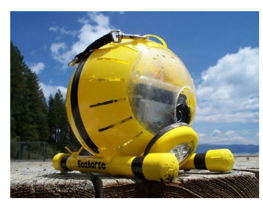
The Seahorse diving bell is designed to go deep beneath the waves and explore, going where man cannot, or won't, to avoid getting wet.