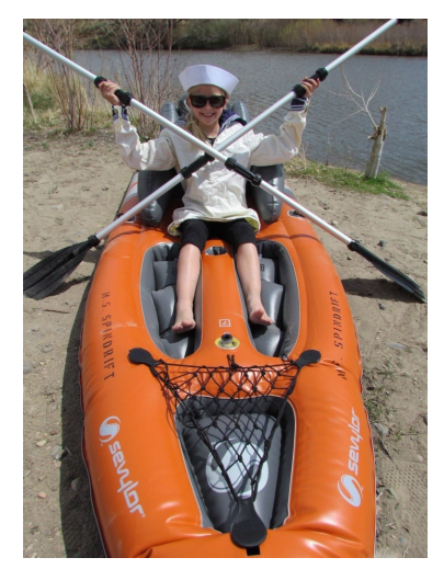
A stalwart sailor aboard the M.S. Spindrift.

Our goal with the Molossian Navy is to explore those watery places that dot the western landscape like gems in the sand. There are actually quite a few lakes and reservoirs through the western desert, and we have set our sights to explore as many as possible. In addition, our Navy stands ready to defend Molossia whenever necessary, through the means of our valiant Naval Infantry.