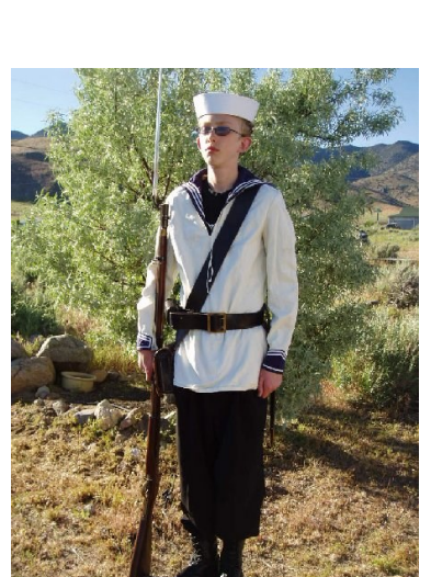
Of course our nation, like any, requires the ability to defend itself. To that end, we have finally formed a viable military service. In conjunction with the Navy, we now have the Molossian Naval Infantry. Though small, our Naval Infantry is well armed, with two state-of-the-art 1853 Enfield rifle-muskets, complete with bayonets. Our Naval Infantry's training is impressive, and our loyal and brave infantrymen always stand ready to defend Molossia against all enemies, foreign and domestic.