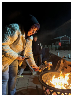
Guys Going into The Fire