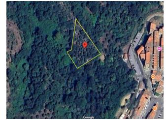
Ulivi From Above