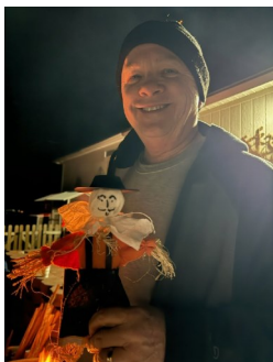
The President's Guy