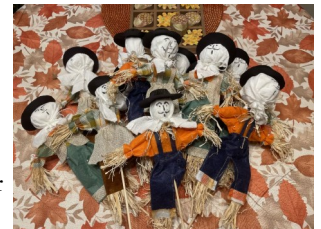
The Many Guys of Molossia

On 5 November 2024 XLVII, Molossians celebrated our annual Guy Fawkes Night. Guy Fawkes Night, or Bonfire Night, is a popular event in Great Britain, dating back to the foiled Gunpowder Plot of 5 November 1605 when Guy Fawkes and 13 of his cohorts conspired to blow up Parliament and King James I of England. After the plot was uncovered and the conspirators executed, the 5th of November became an official holiday in Great Britain, adopted likewise in Molossia, in recognition of our English roots. Prior to the holiday, Molossian citizens gathered in Government House and created their own Guys, to burn in effigy. That done, on the 5th of November, the bonfire in Norton Park was lit and Molossians gathered for the evening festivities. Dinner was bangers and mash, Molossian style, accompanied by hot apple cider and hot chocolate. Dessert was apple crumble. Then the Guy Fawkes rhyme was recited by the company, after which the Guys were committed to the bonfire, one by one, the President's going in first. The evening was concluded with gentle revelry around the fire until it became coals and the celebrants dispersed. A fine time was had by all and we all look forward to next year's Guy Fawkes Night!