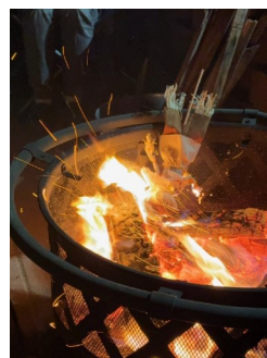
Guy On Fire