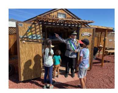
What is The President Pointing At?