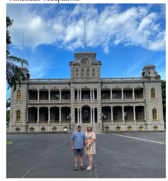
The President and First Lady visiting Tolani Palace.

The only royal palace on American soil is 'Iolani Palace, former home to the kings and one queen of the Kingdom of Hawai'i, before the American occupation.