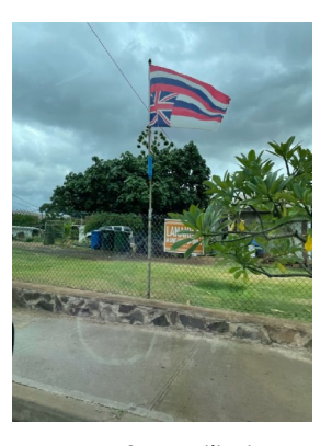
State of Hawai'i Flag, upside down in protest.