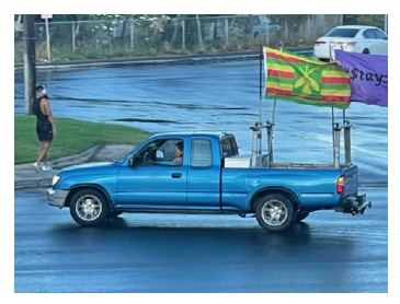
The Kanaka Maoli Flag, with "Stay Mad".