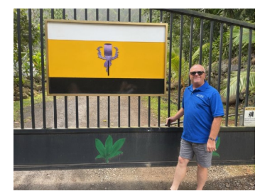
The President Visiting Pu'uhonua O Waimanalo.

The United States admitted its complicity in the overthrow of the rightful Hawaiian government in an official apology in 1993, 100 years after the coup. Nevertheless, there is no movement to restore sovereignty to the Hawaiian Islands and the occupation continues to this day. In 2007, the Molossian Government issued a proclamation condemning the overthrow of the Hawaiian government and the illegal occupation of that nation by American imperialists. Hopefully someday the Hawaiian people will be able to regain their nation and be free once again to take their place in the world community.