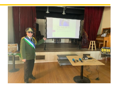
The President Talking