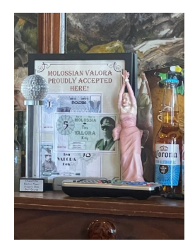
Molossian Valora on Display