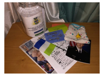
The Contents Of The 2020 Time Capsule