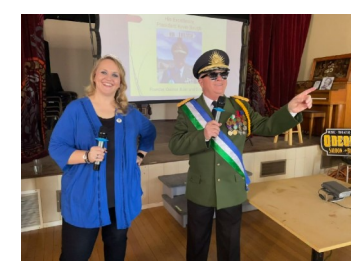
The President and First Lady