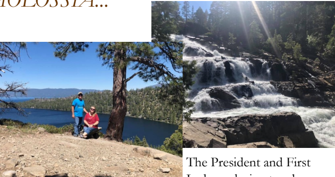
The President and First Lady exploring two beautiful waterfalls at nearby Lake Tahoe.