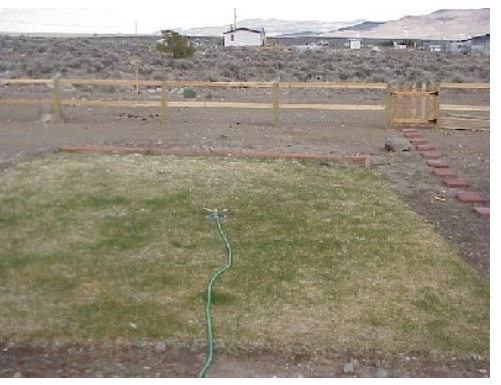
Molossia's Norton Park in 1999 and Today