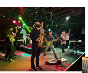
Concert In Asbury Park