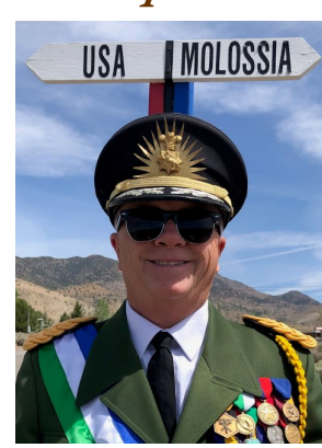
(Cont'd On Page Two)

Each day Molossians work to build a great nation and make it even greater. Our diversity is our strength, each person contributing in their own way to strengthen the whole. Each Molossian is a small piece of a mighty mosaic,