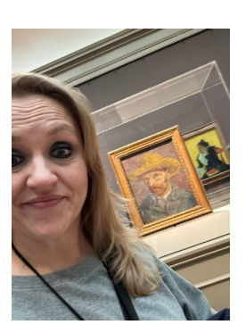
The First Lady And Van Gogh