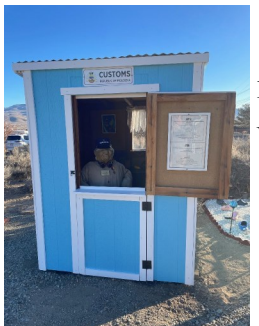
Ready For Visitors!