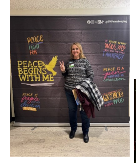
The First Lady Likes Peace