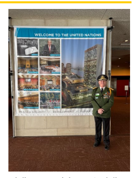
The President At The UN

Other highlights of the First Couple's New York trip included a wonderful concert in Asbury Park, New Jersey, a visit to the Metropolitan Museum of Art, ice skating at Rockefeller Center and an amazing Broadway show. It was a remarkable voyage, full of memorable events, and The President and First Lady look forward to a future return to the Big Apple!