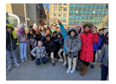
The President Is In There Somewhere