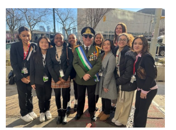
Meeting Fans Of Molossia