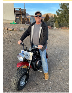
The President Astride His Minibike.

The Republic of Molossia is pleased to announce the advent of its first "sovereign" motor vehicles. Of course there are many cars and even a truck among the conveyances that call our country home. But, because of our small size and proximity to the US, those vehicles must be registered in the US. Recently, however, two minibikes were added to the transport fleet in Molossia and these are registered in Molossia alone. This makes them the first vehicles sovereign to our nation, and not under the authority of the United States. In spite of being registered solely in Molossia, these minibikes can still nevertheless voyage across the border into the US, local to Molossia, much as cars from the US can travel to Canada. The minibikes will be used to roam around our nation, and into the wilds over the border, as desired. We are quite excited and proud to have our own sovereign motor vehicles here in Molossia now, and look forward to them serving our nation well for many years to come!