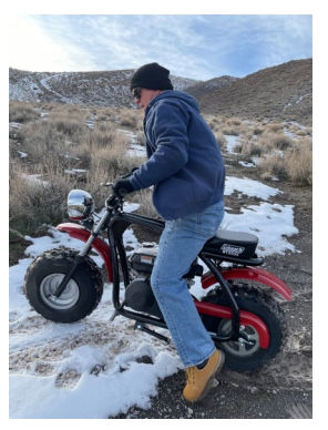
The President Negotiating Snow.