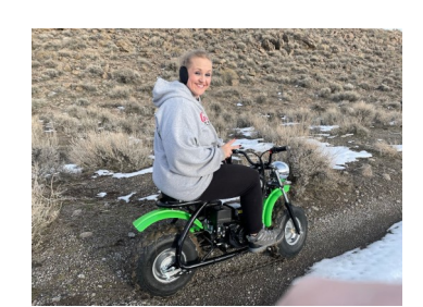
The First Lady Riding.