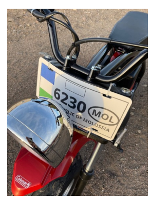
Molossian License Plate.