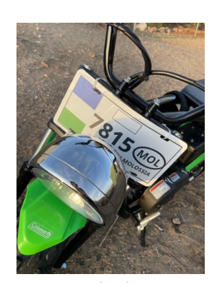
Molossian License Plate