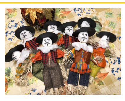
The Many Guys of Molossia