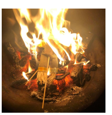
Guys in the Fire