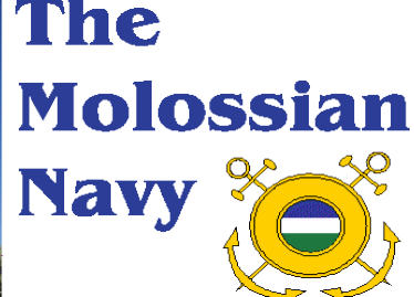
BE A PART!

WWW.MOLOSSIA.ORG/NAVY.INDEX.HTML AND WWW.MOLOSSIA.ORG/MILACADEMY./INDEX.HTML