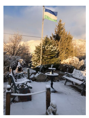
Neĝo en Molossia

Molossia estas dezerta nacio, sed nia nacio ne similas al la sahara dezerto. La saharo estas varma kaj seka, dum en Molossia ni havas ĉiujn kvar sezonojn. Ĉi tio estas ĉar nia nacio estas ĉe alta alto, apud la montoj. Vintro estas malvarma kaj ni ofte havas neĝon kaj pluvon. Printempo kutime estas tre ventema, kun oftaj neĝo kaj pluvo. Someroj estas varmaj kaj sekaj, kaj aŭtuno kutime estas tre agrabla, kun komfortaj temperaturoj. Dum la tuta jaro Molossia estas bela, kvankam ne gravas la vetero!