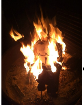
Guy Fawkes Burning

forward to next year's Guy Fawkes Night!