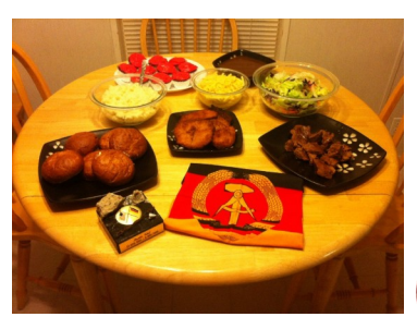
German Repast on the 30th

On 2 November 2013 XXXVI the Republic of Molossia celebrated the 30th anniversary of its War with East Germany. For 30 years now, Molossia has been at war with the now -defunct East Bloc stalwart, home to Trabis, the Stasi and the Berlin Wall. War was declared on 2 November 1983 VII for reasons that are rather obscure, as was the long forgotten war declaration, discovered over fours years ago in the dusty Molossian archives. The end of East Germany, which took place on 3 October 1990, should have also marked the end of the Molossian war with that nation. However, East Germany lives on in an unlikely place, tiny Ernst Thälmann Island (Cayo Ernesto Thaelmann), off the coast of Cuba. The uninhabited island was given by Fidel Castro as a gift to East Germany in 1972 during a state visit to that country. The island was renamed in honor of German Communist politician Ernst Thälmann, who was the leader of the Communist Party of Germany (KPD) during much of the Weimar Republic and was later imprisoned