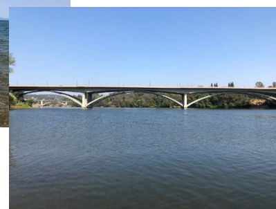
The American River