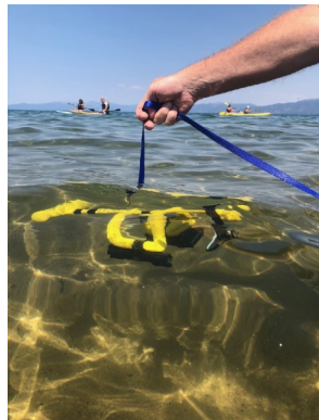
Into The Water