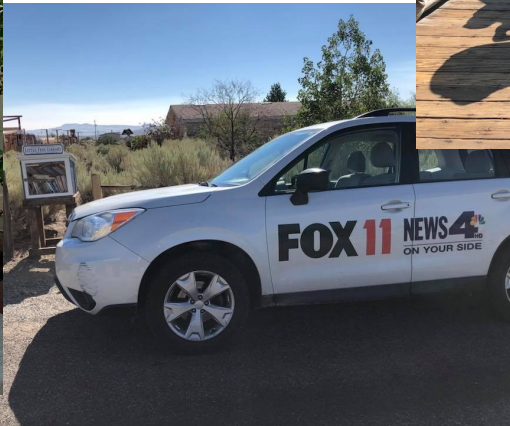
Local news visiting Molossia!