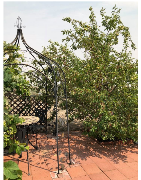
Crabapples and gazebo in Norton Park, under smoky skies from the recent California wildfires.