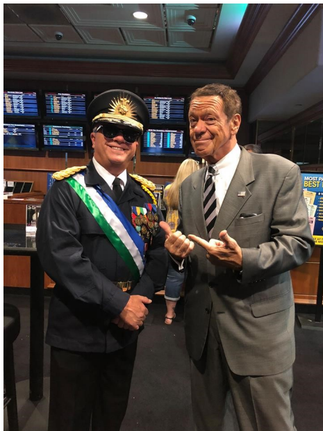
The President and actor Joe Piscopo, hanging out at the Carson Nugget, during filming of the new TV Show 'Casino Boss'.