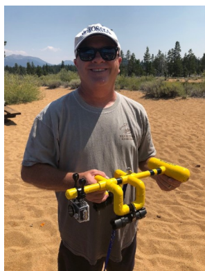
Ready To Launch