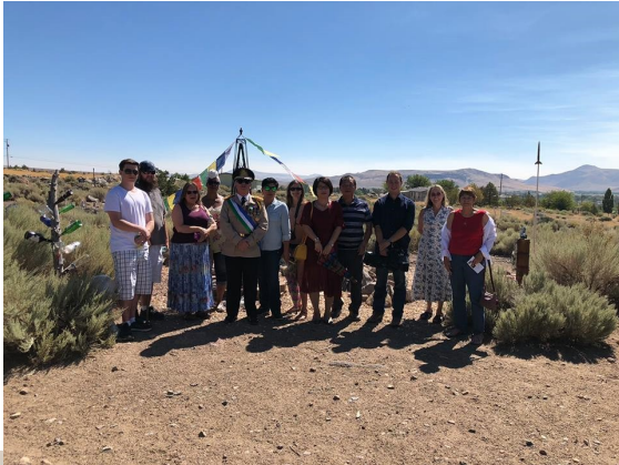
August Tourist Group - 173 tourists this year and counting - look out Nauru!