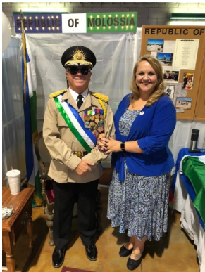
The President And First Lady Representing

On Wednesday, 22 August 2018 XLI, The President and First Lady attended the annual Diversity Day event, held at the Nevada National Guard, in Carson City Nevada. Diversity Day is about celebrating different world cultures through music, dance, costumes and food. This fifth annual Diversity Day featured Polynesian music, bagpipe players, dancers, singers and 18 food booths representing a wide variety of cultures. The Republic of Molossia has participated in four Diversity Day events, the past two celebrating our nation itself. As with last year's event, a booth was set up showcasing pictures of our nation, as well as providing food and drink native to Molossia. This year our representative food was Molkebabbs (skewers of meat and cheese) and cookie dough ice cream, representing the chocolate chip cookie dough upon which our money is based. The beverage provided was Molossolini, Molossia's extremely popular signature drink. Many visitors to Molossia's booth were well aware of our nation, while some needed educating on who and what Molossia is. In turn, The President and First Lady enjoyed learning about other cultures from around the world. All in all, this year's Diversity Day event was a great success and we look forward to next year's celebration!