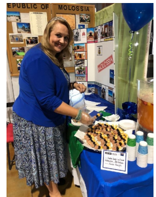
The First Lady Prepping Food