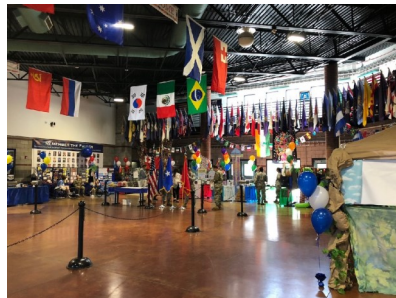
Diversity Day Setup