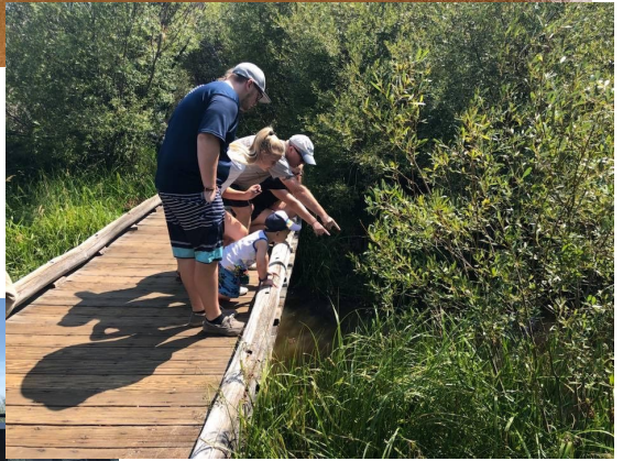
Looking for frogs at Taylor Creek, Lake Tahoe!