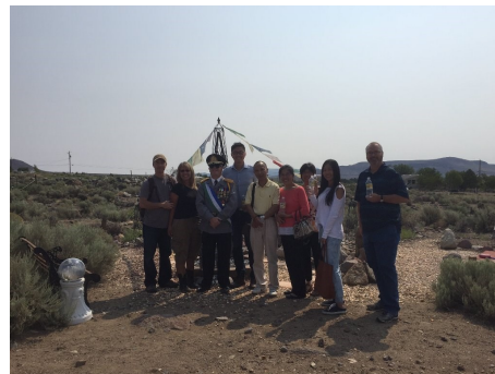
Our Latest Visitors