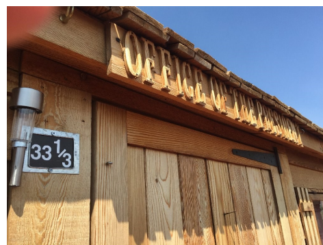
The President's Address

There has been a new change to Red Square, the administrative heart of Molossia - street addresses. Red Square is home to several buildings, the Molossia Post Office, the Bank of Molossia, the Tiki Hut Bar and Grill, the Molossia Trading Company and of course the Office of the President. Now each of those buildings has its own address, each very unique. The Post Office is at 10/6 Red Square, the Trading Company is 221B Red Square, the President's Office is at 33 1/3 Red Square, the Bank is at 454 Red Square and the Tiki Hut is at 50 Red Square. The address numbers will make identifying the Red Square buildings easier in correspondence and add a little flair to our square!