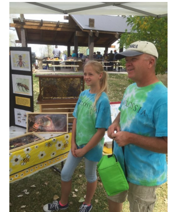
Learning About River Topics