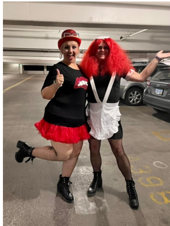
The First Lady and a Friend at the Rocky Horror Picture Show!