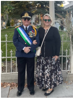
The President and First Lady.

On 29 October 2022 XLV, His Excellency, The President and the First Lady participated in the annual Nevada Day event. Located in Carson City, Nevada, this event celebrates the anniversary of the admission of Nevada as a state. Nevada was admitted to the Union on 31 October 1864. At that time, the state was a significant producer of silver and gold, and therefore played a major role in financing the Union war effort during the United States Civil War. Nevada's admission as a state helped not only to pay for the War, but ensured a northern majority in Congress afterward.