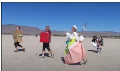
The Ladies' Race.

On 1 October 2022 XLV, the Republic of Molossia hosted the 2022 Misfit Regatta. Inspired by the famous Henley-on-Todd Regatta held in Alice Springs, Australia, the Misfit Regatta is a dry land cardboard boat race. It takes place on Misfit Flats, some 16 Imperial Nortons (16 km / 10 mi) east of Molossia. Famed for being a filming location for the Clark Gable/Marilyn Monroe movie "The Misfits", the Flats are an open, dry lakebed, perfect for racing. At 11:14 AM Molossian Standard Time (MST) the racers arrived at the race location and helped set up the start and finish lines. Then at about 11:39 AM MST the first race took place, with cameras rolling and spectators cheering. There were several races held, including kids only, group and group backwards, guys only, ladies only and sideways. A total of nine racers competed, and competed with all their might with much to be proud of. After six races, the event ended with a demolition derby, generally destroying the cardboard "boats". This year's Regatta was a resounding success, the sixth of many, with one planned every other year at this time. Future races may include an obstacle course and a competition for best "boat". Well done racers, and see you in two years!