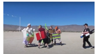
The Demolition Derby.