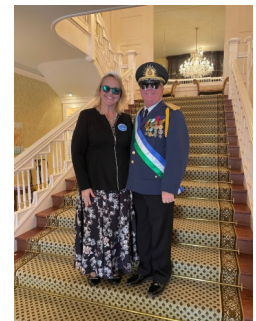
Visiting the Governor's Mansion