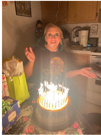
The First Lady Nearly Starts a Fire on Her Birthday!