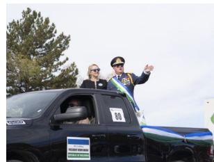
Waving to the Crowd