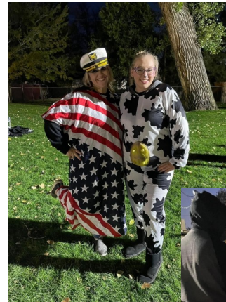
Halloween Costumes All Around Molossia!