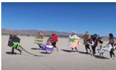
The Everybody Race.