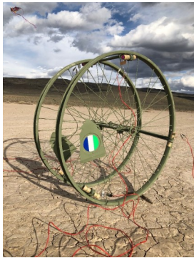
The Great Panjandrum