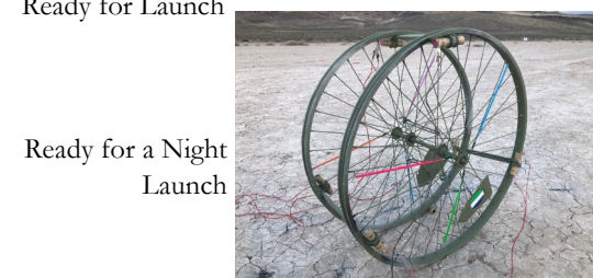
Ready for a Night Launch