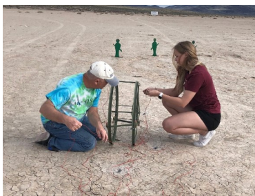
Readying the Panjandrum