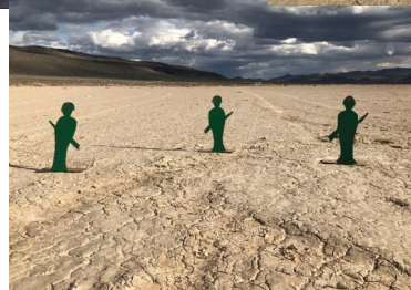
East German Targets