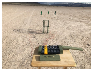
Ready for Launch