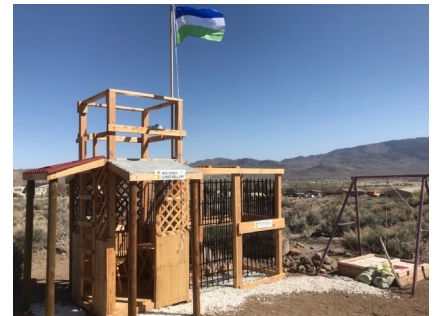
Constabulary And Salt Mine