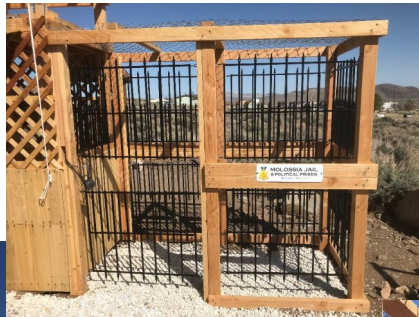
Jail And Political Prison