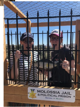
Visiting Tourists In Jail for Importing Catfish