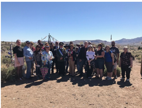
Mighty Tour Group