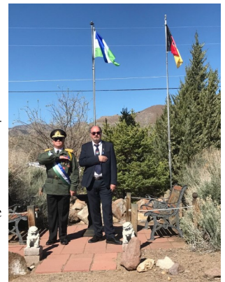
The President And The Ambassador In Republic Square