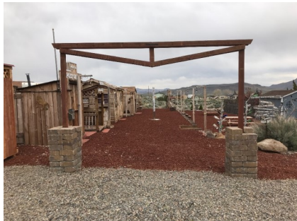
The Gateway Rises!

In late January 2017 XL His Excellency, The President announced the building of Molossia's Friendship Gateway. This Gateway is dedicated to inclusiveness and openness - a hole in the wall, so to speak. We invited Molossia's friends and allies to contribute to the Gateway and help us build it, one or more bricks at a time. Thanks in large part to their support the Friendship Gateway is today a reality. After nearly two months of assembling materials and a weekend of frenzied construction, Molossia's Friendship Gateway has risen over the entrance to Red Square. There is still more that needs to be done - more bricks are needed - but today the Gateway stands as Molossia's simple monument to peace, amity and understanding among all peoples.