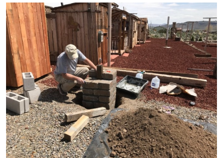
The Gateway Under Construction

Help us finish the Friendship Gateway, buy a brick and make a difference!