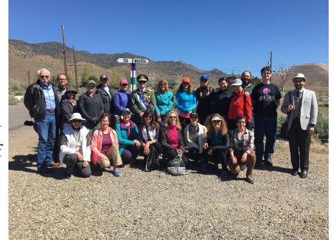
Our Big Group Of Visitors.