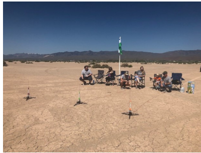
Watching the Launch