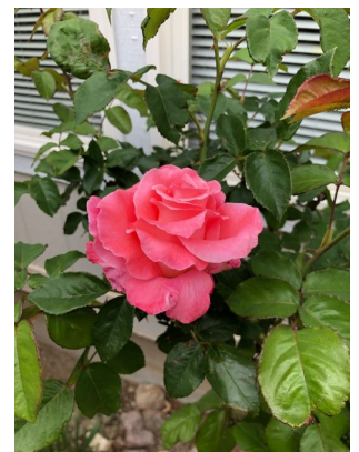
First Rose of Spring!