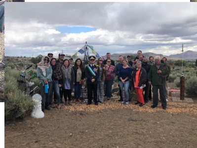
Everyone Who Helped Us Celebrate Founder's Day!