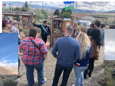
Founder's Day Tour.