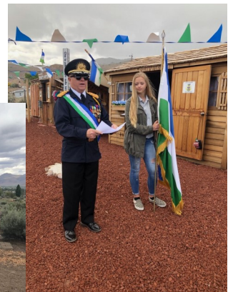
The President Delivering His Speech.