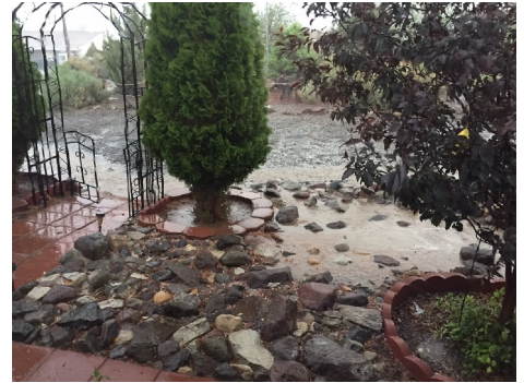
Flooding In Front Of Government House.

On 9 June 2015 XXXVIII a tropical moisture plume moved over the Great Basin Desert in which Molossia lies, producing heavy rain, hail and wind. The sudden, heavy rain quickly saturated the dry desert soil producing conditions ripe for flash flooding. In short order the desert washes were filled with torrents of muddy water, carrying along sand and rocks and digging deep furrows in the ground. In Molossia the water flooded across the land, creating numerous streams where there had been none before and scouring deeper the existing washes. A river developed along the border with the U.S. and also along Alphonse Simms Circle in front of Government House. Most unprecedented though was the raging flood that filled Ghost River, a normally dry wash directly behind the Tower of the Winds. This was the first time in the 17 years that Molossia has called this area home that water has been seen in the wash, hence the name "Ghost River". The waters were just passing through our nation, however, on their way downhill toward the nearby Dayton Valley. There the desert flats became a huge lakebed, and flooding menaced homes and blocked roads. Finally, after an hour-long down-pour, the rain abated and the waters slowly receded. Soon, the desert will be dry again, but the memory of this deluge will not be forgotten as quickly.