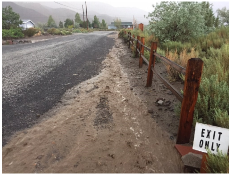
Another River, On The Border.