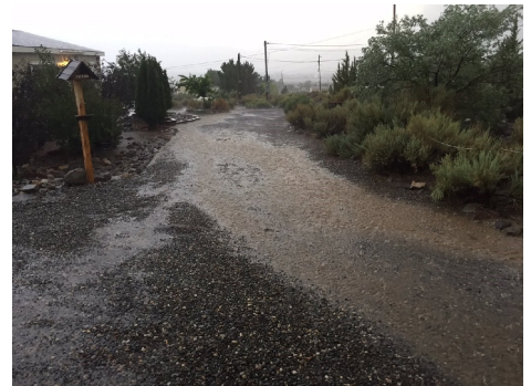
River In Alphonse Simms Circle.