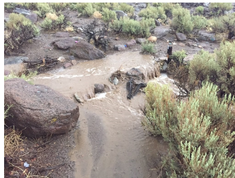
Ghost River, Usually Dry.