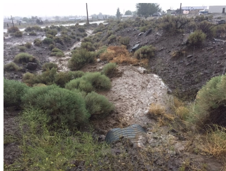
A Formerly Dry Creek In America.