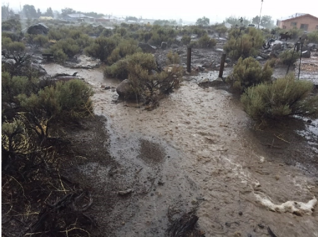
Ghost River, Near The Tower Of The Winds.