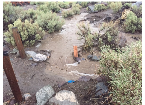
Ghost River Waterfall.