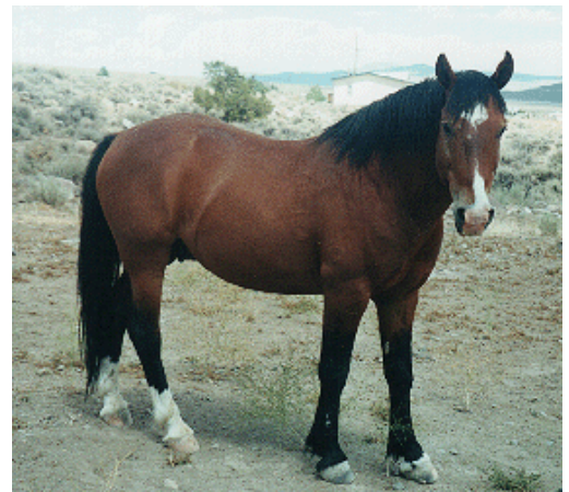
Mustang (Wild Horse) ( Equus caballus ) Photo taken in Molossia

In 1971, the United States Congress recognized Mustangs as "living symbols of the historic and pioneer spirit of the West, which continue to contribute to the diversity of life forms within the Nation and enrich the lives of the American people." Today, the Mustang population is managed and protected by the US Bureau of Land Management. More than half of all Mustangs in North America are found in Nevada (which features the horses on its State Quarter in commemoration of this). Mustangs frequent the area around Molossia and are generally respected and protected by the local residents. In 1998 the Mustang was adopted as the National Animal of Molossia in recognition of the strength, hardiness and independent characteristics that these noble animals represent.