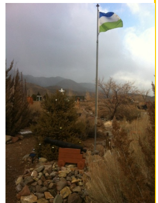
The Flag And National Christmas Tree On A Wintry Christmas Day.