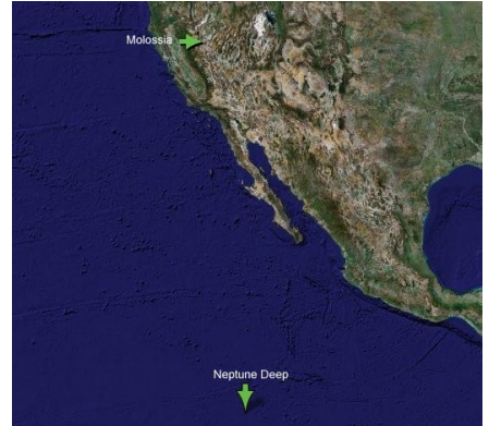
Location Of Neptune Deep.