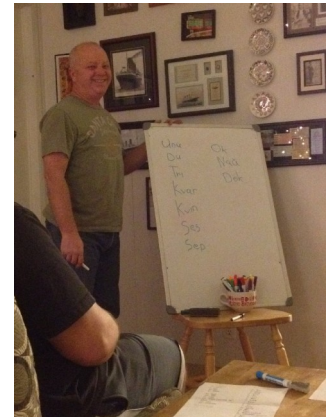
The President Teaching.

Sur Zamenhova Tago 2014, Lia Ekscelenco, La Prezidanto donis lecionojn sur Esperanto en Domo de Registaro. Dum periodo de pluraj horoj li klarigis la diversaj partoj de parolado kaj gramatikaj kaj laboris kun tre atenta aŭskultantaro plibonigi sian Esperanton kompreno. Post la lecionojn ĉiuj ĉeestantaj spektis kelkaj videoj en YouTube por plibonigi la lernadon sperto. Ĝi atendas ke pli bona kompreno de tiu simpla, tamen valora lingvo servos nian nacion bone en la venontaj jaroj, farante Molossia eĉ pli unika loko ol ĝi jam estas.