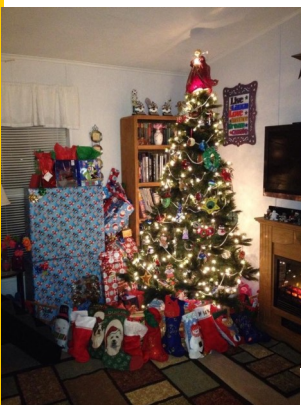
The National Christmas Tree Inside Government House.

Christmas is a major holiday in Molossia and a time of great tradition as well as festivity. Christmas is one of the most important holidays in the Republic of Molossia, and is traditionally a three-day celebration. The holiday actually begins on December 24th with Christmas Eve activities, including watching movies, baking (and eating) cookies, drinking eggnog and playing board games as a family. Christmas Eve dinner is our traditional meal of lasagna, reflecting the Italian heritage of Molossia. The evening ends with the reading of the "Night Before Christmas", and with tracking the arrival of Santa Claus using NORAD's website. Christmas morning, December 25th, begins early, as the family descends upon the hoard of presents beneath the National Christmas Tree. Once the frenzy of present-opening ends, Christmas breakfast is made and served, and afterward everyone settles down to enjoy their gifts. Christmas dinner takes place in later afternoon, largely wrapping up a lazy, relaxing day. Christmas dinner consisted this year of turkey, ham, mashed potatoes, stuffing, and all the trimmings. Boxing Day is on December 26th, and is the last day of the Christmas holidays. While no special events take place, dinner on Boxing Day is traditionally Shepherd's Pie, in keeping with the British theme of the day. This wraps up the Christmas events for the year, with everyone eagerly looking forward to the distant arrival of next year's Christmas.