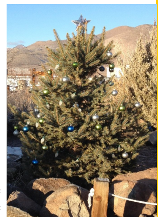
The National Christmas Tree in Republic Square

Christmas is a major holiday in Molossia and a time of great tradition as well as festivity. Christmas is one of the most important holidays in the Republic of Molossia, and is traditionally a three-day celebration. The holiday actually begins on December 24th with Christmas Eve activities, including watching movies, baking (and eating) cookies, drinking eggnog and playing board games as a family. Christmas Eve dinner is our traditional meal of lasagna, reflecting the Italian heritage of Molossia. The evening ends with the reading of the "Night Before Christmas", and with tracking the arrival of Santa Claus using NORAD's website. Christmas morning, December 25th, begins early, as the family descends upon the hoard of presents beneath the National Christmas Tree. Once the frenzy of present-opening ends, Christmas breakfast is made and served, and afterward everyone settles down to enjoy their gifts. Christmas dinner takes place in later afternoon, largely wrapping up a lazy, relaxing day. Christmas dinner consisted this year of ham, mashed potatoes, stuffing, and all the trimmings. Boxing Day is on December 26th, and is the last day of the Christmas holidays. While no special events take place, dinner on Boxing Day is traditionally Shepherd's Pie, in keeping with the British theme of the day. This wraps up the Christmas events for the year, with everyone eagerly looking forward to the distant arrival of next year's Christmas.