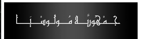
Republic of Molossia in Arabic