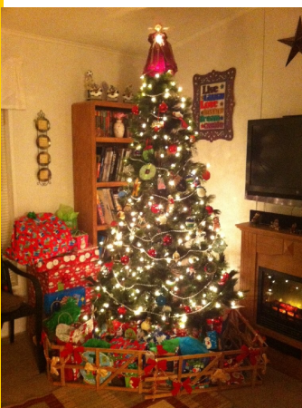
The National Christmas Tree inside Government House

Christmas is a major holiday in Molossia and a time of great tradition as well as festivity. Christmas is one of the most important holidays in the Republic of Molossia, and is traditionally a three-day celebration. The holiday actually begins on December 24th with Christmas Eve activities, including watching movies, baking (and eating) cookies, drinking eggnog and playing board games as a family. Christmas Eve dinner is our traditional meal of lasagna, reflecting the Italian heritage of Molossia. The evening ends with the reading of the "Night Before Christmas", and with tracking the arrival of Santa Claus using NORAD's website. Christmas morning, December 25th, begins early, as the family descends upon the hoard of presents beneath the National Christmas Tree. Once the frenzy of present-opening ends, Christmas breakfast is made and served, and afterward everyone settles down to enjoy their gifts. Christmas dinner takes place in later afternoon, largely wrapping up a lazy, relaxing day. Christmas dinner consisted this year of ham, mashed potatoes, stuffing, and all the trimmings. Boxing Day is on December 26th, and is the last day of the Christmas holidays. While no special events take place, dinner on Boxing Day is traditionally Shepherd's Pie, in keeping with the British theme of the day. This wraps up the Christmas events for the year, with everyone eagerly looking forward to the distant arrival of next year's Christmas.