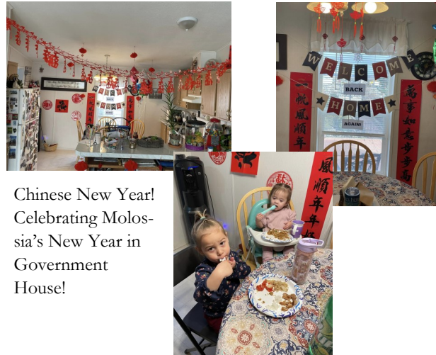
Chinese New Year! Celebrating Molossia's New Year in Government House!