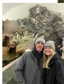
Visiting the fauna of the St. Louis Zoo!