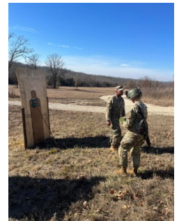
Getting Ready to Blow Stuff Up!