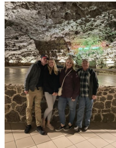
Deep inside Meramec Caverns!