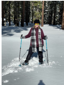
The First Lady Keen For Adventure!