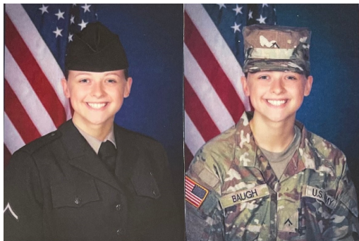
Our Soldier Constable!