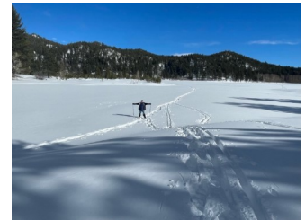
The President Conquers The Lake