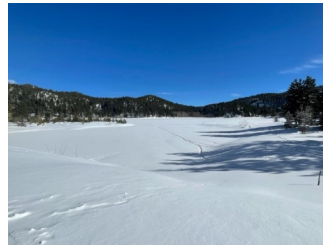
Frozen Spooner Lake