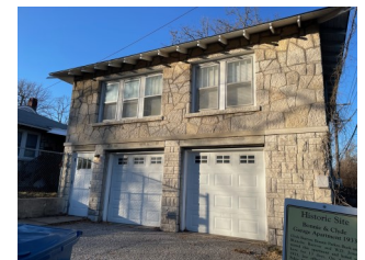
Bonnie and Clyde's house in Joplin, MO!