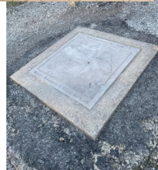
The meeting of Kansas, Missouri and Oklahoma!