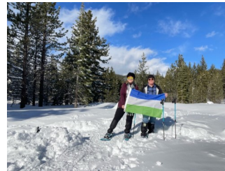
The Molossian Flag In The White Wilderness