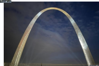
The Gateway Arch!