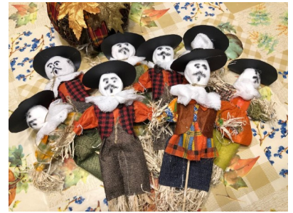
The Many Guys of Molossia

On 5 November 2019 XLII, Molossians celebrated our ninth annual Guy Fawkes Night. Guy Fawkes Night, or Bonfire Night, is a popular event in Great Britain, dating back to the foiled Gunpowder Plot of 5 November 1605 when Guy Fawkes and 13 of his cohorts conspired to blow up Parliament and King James I of England. After the plot was uncovered and the conspirators executed, the 5th of November became an official holiday in Great Britain, adopted likewise a few years ago in Molossia, in recognition of our English roots. Prior to the holiday, Molossian citizens gathered in Government House and created their own Guys, to burn in effigy. That done, on the 5th of November the bonfire in Norton Park was lit and Molossians gathered for the evening festivities. Dinner was shepherd's pie, Molossian style, accompanied by hot apple cider and apples dipped in caramel. Then the Guy Fawkes rhyme was recited by the company, after which the Guys were committed to the bonfire, one by one, the President's going in last. The evening was concluded with gentle revelry around the fire until it became coals and the celebrants dispersed. A fine time was had by all and we all look forward to next year's Guy Fawkes Night!