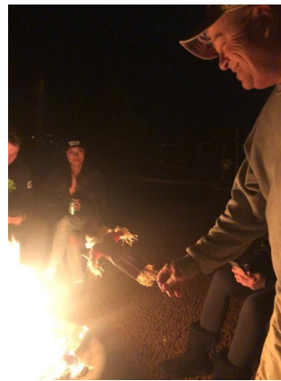
The President's Guy Goes In