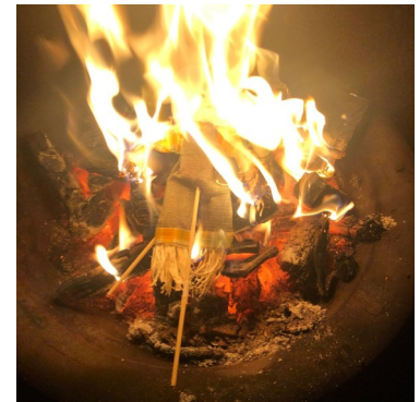
Guys in the Fire