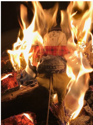
Guy On Fire

On 5 November 2017 XL, Molossians celebrated our seventh annual Guy Fawkes Night. Guy Fawkes Night, or Bonfire Night, is a popular event in Great Britain, dating back to the foiled Gunpowder Plot of 5 November 1605 when Guy Fawkes and 13 of his cohorts conspired to blow up Parliament and King James I of England. After the plot was uncovered and the conspirators executed, the 5th of November became an official holiday in Great Britain, adopted likewise six years ago in Molossia, in recognition of our English roots. Prior to the holiday, Molossian citizens gathered in Government House and created their own Guys, to burn in effigy.