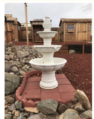
Relocated Pineapple Fountain

Winter in Molossia is often a time of changes and of construction. This year is no different; now that tourist season is over and in between foul weather, it is time to remodel. The first project, accomplished in mid-November, was the move of the Bottle Forest from Red Square to its new home next to the Tower of the Winds. Next came the move of the famous Pineapple Fountain from Norton Park to its new location in Red Square, where the Bottle Forest used to be. Also planned, the long-anticipated construction of the Molossia Constabulary, next to Molossia's Salt Mine. The Molossia Railroad is also slated to be rerouted, eliminating Thunder Mountain Tunnel; an adjacent structure in Norton Park is also planned to be moved, opening up a new area in the Park. All of these changes will make our nation a better place to visit and to live in.