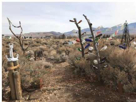
Relocated Bottle Forest