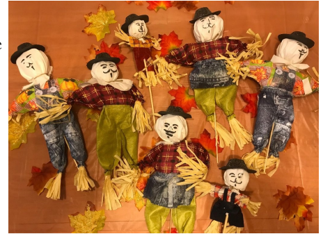
The Many Guy's of Molossia

That done, on the 5th of November the bonfire in Norton Park was lit and Molossians gathered for the evening festivities. Dinner was shepherd's pie, Molossian style, accompanied by hot apple cider and apples dipped in caramel. Then the Guy Fawkes rhyme was recited by the company, after which the Guys were committed to the bonfire, one by one, the President's going in first. The evening was concluded with gentle revelry around the fire until it became coals and the celebrants dispersed. A fine time was had by all and we all look forward to next year's Guy Fawkes Night!