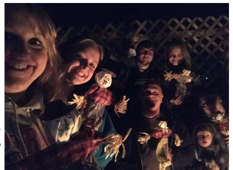
Gathered Around the Bonfire, Guys Ready to Go