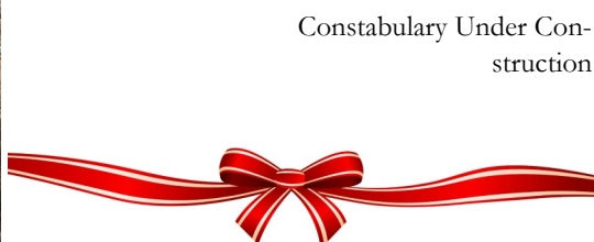
Constabulary Under Construction