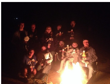
Gathered Around the Bonfire, Guys Ready to Go!