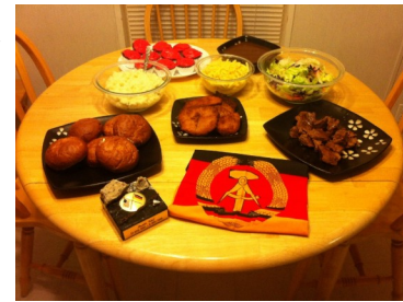
German Repast on the 30th

To celebrate the 30th anniversary of the War, a party was held in Government House on the anniversary day. Along with displaying the East German flag and a piece of the Berlin Wall, a German-themed dinner was served. The meal consisted of sauerbraten, wienerschnitzel, spätzle, kartoffelpüree, brot, gemischte salat and red velvet cupcakes, because the East was red. During dinner, His Excellency, The President spoke about the origins of the War with East Germany to an attentive table-side audience. A fine celebration was had by all. In the meantime, the War goes on, and our nation must continue to be ever vigilant against the East German threat!