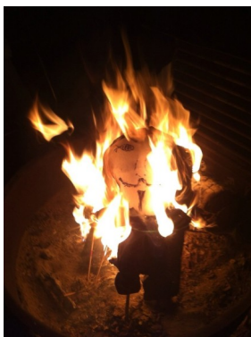
Guy Fawkes Burning