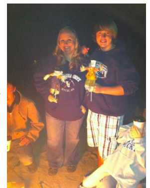
Ready to Burn

On 5 November 2013 XXXVI, Molossians celebrated our third annual Guy Fawkes Night. Guy Fawkes Night, or Bonfire Night, is a popular event in Great Britain, dating back to the foiled Gunpowder Plot of 5 November 1605 when Guy Fawkes and 13 of his cohorts conspired to blow up Parliament and King James I of England. After the plot was uncovered and the conspirators executed, the 5th of November became an official holiday in Great Britain, adopted likewise three years ago in Molossia, in recognition of our English roots. A day prior to the holiday, Molossian citizens gathered in Government House and created their own Guys, to burn in effigy. That done, they traveled to nearby Dayton State Park and built a sizable bonfire, joined by the Tapley Family, friends of Molossia. Dinner was banger wraps and mini cottage pies, followed by hot apple cider and apples dipped in caramel. Then the Guy Fawkes rhyme was recited by the company, after which the Guys were committed to the bonfire, one by one, the President's going in first. The evening was concluded with gentle revelry around the fire until it became coals and the celebrants returned to Molossia. A fine time was had by all and we all look forward to next year's Guy Fawkes Night!