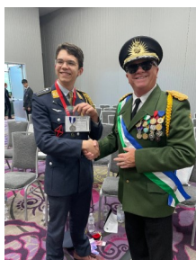
Awarding a Medal.