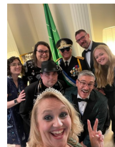
Smiles at the Diplomatic Reception.