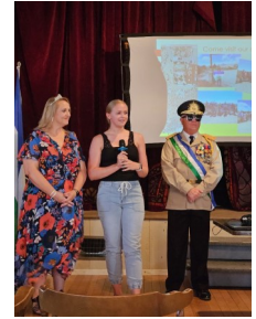
The Chief Constable Chimes In