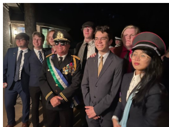
The President with Young World Leaders.