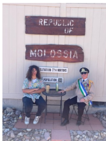
Two Presidents Conferring