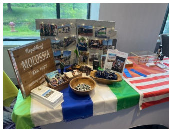
Molossia's MicroCon Display.