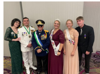
Molossians Representing at MicroCon.