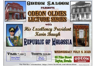
The President Is Coming

On Wednesday, 5 July 2023 XLVI The President, First Lady and Chief Constable visited the historic Odeon Hall, in Dayton, Nevada. The purpose was to talk all about our great nation, spreading the word about Molossia to yet another audience. The Odeon Hall is an historic saloon and dance hall that was built in 1863, and has hosted such celebrities as Mark Twain and Adolph Sutro among its patrons and speakers. Recently remodeled and reopened, the Odeon again hosts talks and presentations, among them our President. For over an hour His Excellency, the First Lady and Chief Constable spoke about Molossia before a crowd of rapt listeners, showing pictures of our nation and answering questions. The audience was very appreciative and applauded frequently, evidently enjoying the idea of a self-declared nation right down the road. In addition, Molossia's signature drink, the Molossolini has been added to the Odeon Saloon menu, our money, the Valora will be accepted there and a barstool has been proclaimed to be the official Molossian Embassy to the Hall. It is wonderful to be able to share the stories, culture and mere existence of Molossia, and we look forward to future opportunities to do so.