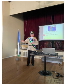
The President Telling Tales