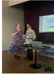
The First Lady Answering Questions