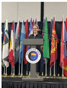
Queen Carolyn of Ladonia Opens MicroCon.

2023 was an amazing event and one of memories and experiences that will last for a very long time!