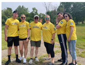
Molossia's Nemean Games Team.