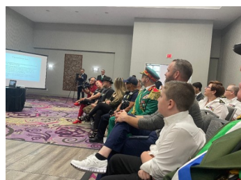
Rapt Audience at MicroCon.