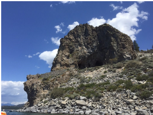
Approaching Cave Rock