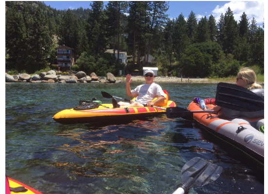
The Navy Ready To Deploy

These sorties complete, the mission was declared a success, and our brave Navy retired from the waters, returning to Molossia.