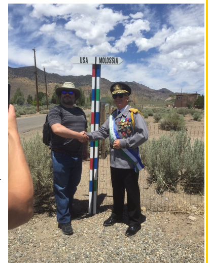
The President Welcomes Jack Black To The Border