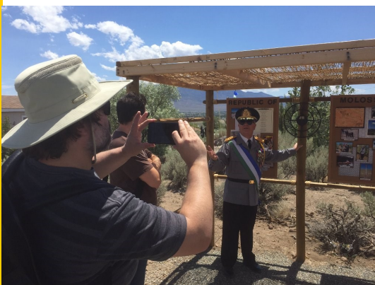
The Star Photographing The President