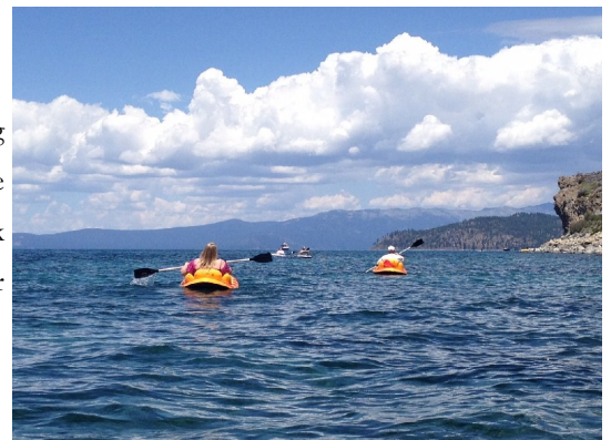
Returning To Cave Rock Harbor