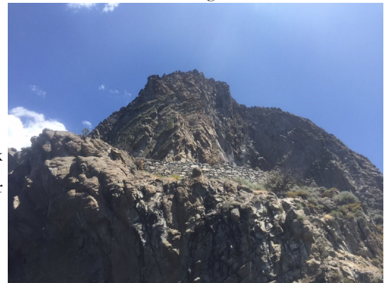
The Rock Towers Over