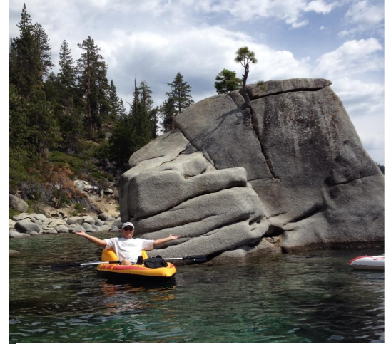
His Excellency, The President aboard the M.S. Bandicoot, during a Naval Expedition to Bonsai Rock in Lake Tahoe, 12 July 2014 XXXVII.