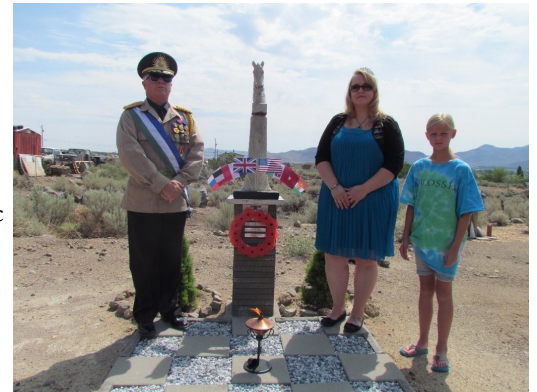
At The Heroes Monument

On 28 July 2014 XXXVII, the Republic of Molossia held a remembrance ceremony of the 100th anniversary of the beginning of the First World War. At 11:00 AM MST, His Excellency, The President, The First Lady, the Chief Constable and guests gathered at the Molossia Heroes Monument to lay a wreath in honor of the sacrifices made during the War to End All Wars. It was at 11:00 AM on 28 July 1914 that Austria-Hungary declared war on Serbia, the first in a series of such martial declarations that precipitated the war. Within weeks of that declaration, the nations of Europe were locked in a titanic struggle that stretched from the muddy trenches of France to the fringes of Russia to the sun-baked shores of Gallipoli - even to Africa and the distant Pacific Ocean. For over four years this all-encompassing conflict would convulse the world until finally the guns fell silent at 11:00 AM on 11 November 1918. More than 9 million combatants were killed, a casualty rate exacerbated by the belligerents' technological and industrial sophistication, and tactical stalemate. It was one of the deadliest conflicts in history, paving the way for major political changes, including revolutions in many of the nations involved.