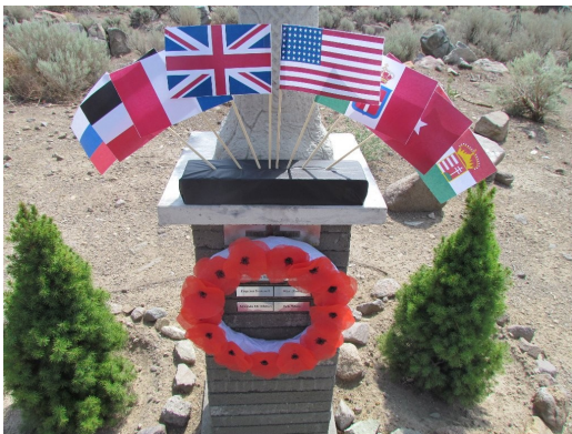
Flags and Poppies

Said His Excellency, The President at the Heroes Monument, "One hundred years ago World War I began and one hundred years later the world is a much different place. But conflict continues and world peace remains elusive. As we lay this wreath today, we do so not just in remembrance of one the greatest wars fought by man, but also in the ongoing hope for peace for all mankind."