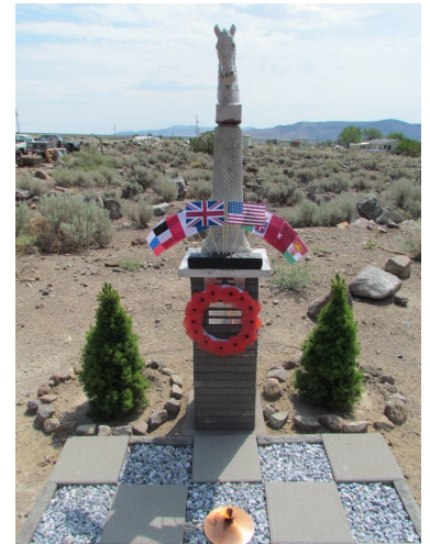
The Heroes Monument Decorated

Said His Excellency, The President at the Heroes Monument, "One hundred years ago World War I began and one hundred years later the world is a much different place. But conflict continues and world peace remains elusive. As we lay this wreath today, we do so not just in remembrance of one the greatest wars fought by man, but also in the ongoing hope for peace for all mankind."