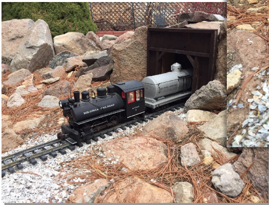
Mustang Leaving The Tunnel