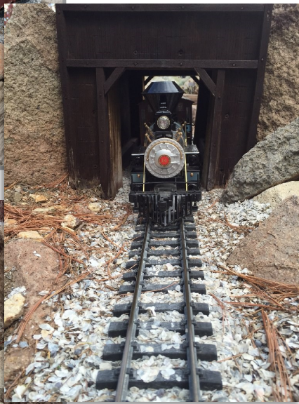
In The Tunnel