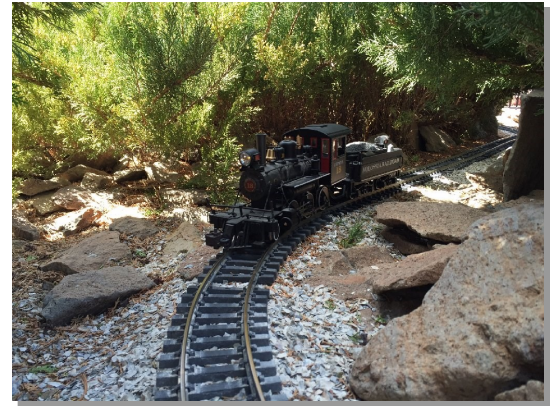
Zephyr Under The Trees