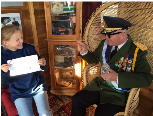
A Rejected Bribe!