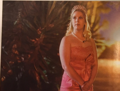
Members of the House of Homestead of Andorra.