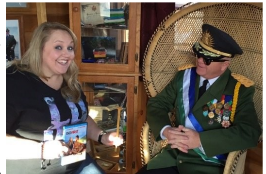
The First Lady's Bribe!