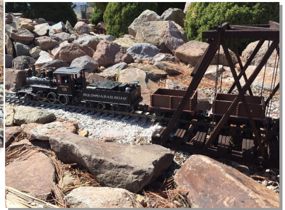
Zephyr Crossing The Bridge