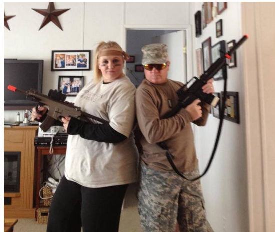
The Molossian Naval Infantry ready for action!