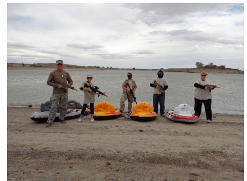
Ready for action!