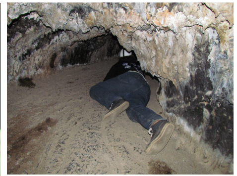
Crawling in Catacombs Cave.