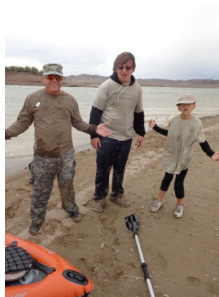
Muddy and wet.