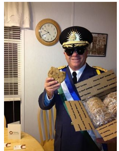
Cookies from the Oregon Cookie Company!