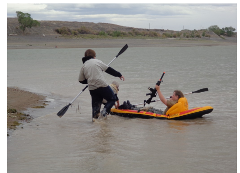
Rescuing a comrade.