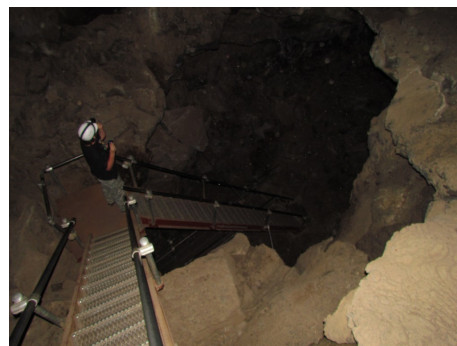
Stairs into Skull Cave.