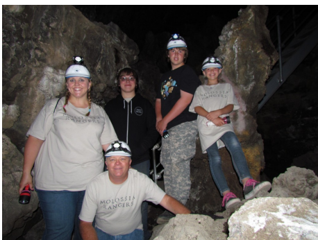
Inside Sentinel Cave.