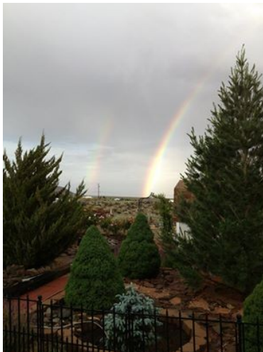
Double Rainbow Over Molossia!