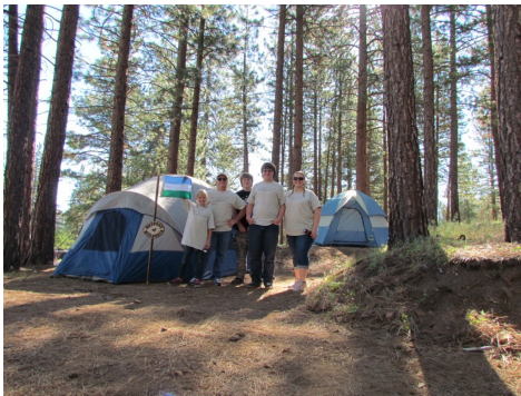
Outpost Molossia, Tionesta.

Further expeditions were cancelled when the Ranger's van developed engine trouble, which resulted in a tow truck ride to nearby Klamath Falls and a night there. The next day the Rangers set out for home, arriving back in Molossia late in the afternoon. This concluded a successful, although tumultuous, mission for our dauntless Rangers, with always more to come!