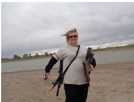
The First Lady hauling gear.