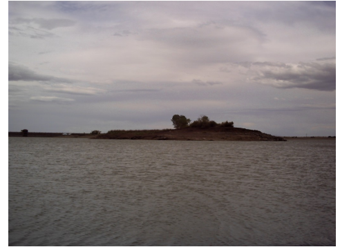
Objective: Sandpiper Island.