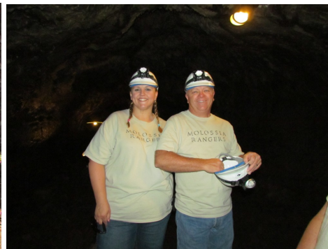
Ready for caving.