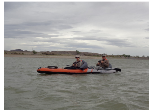
Braving the waters.